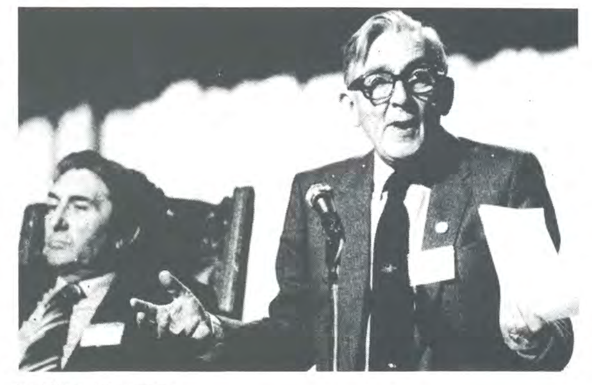
Lionel Murray - Sellout merchant

Sure enough, following the mass picket and the TUC's pledges of support all "hostile action" against Eddie Shah was called off by the NGA. As we go to press there has not yet been a resumption of the picketing. Emboldened, employers like Dimbleby and Maxwell got injunctions against the NUJ and SOGAT 82 safe in