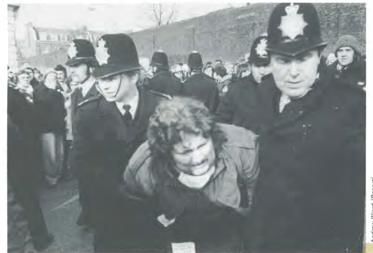
Para-military thugs in action

The dispute at Warrington began around one of the Tories' main objects of hete - the closed shop. It is testimony to the continued resilience and union loyalty of millions of workers, despite their treacherous leaders, that the