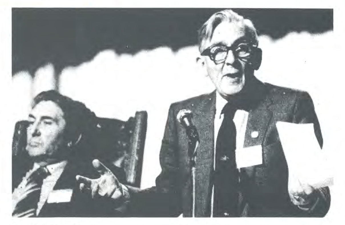
Lionel Murray - Sellout merchant

Sure enough, following the mass picket and the TUC's pledges of support all "hostile action" against Eddie Shah was called off by the NGA. As we go to press there has not yet been a resumption of the picketing. Emboldened, employers like Dimbleby and Maxwell got injunctions against the NUJ and SOGAT 82 safe in