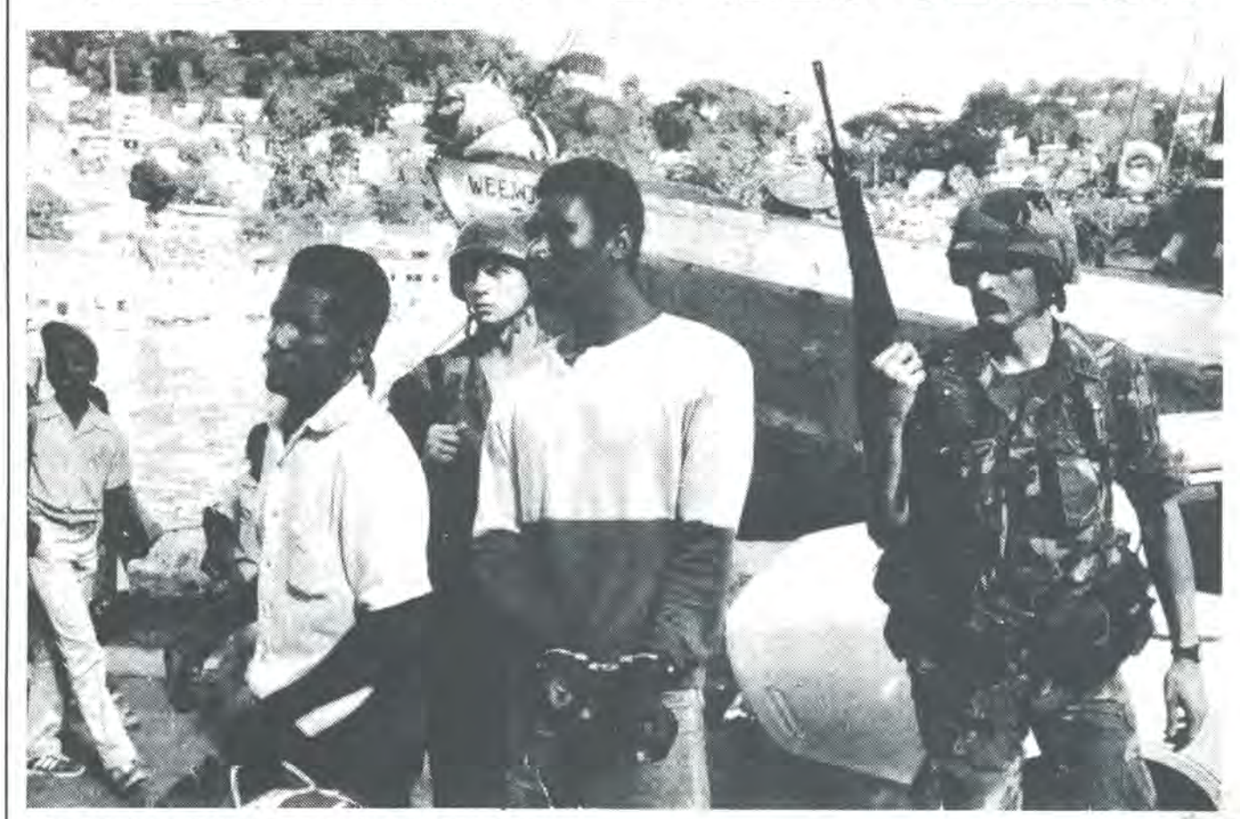
U.S. paratrooper and stooge policeman lead away a detainee.

"Now that the ideological future of Grenada is assured, we feel this is the big take off". This was how the leader of a group of US businessmen from Fort Lauderdale aptly summed up their view of the future of Grenada. Perhaps "big rip off" would have been a more appropriate description of their plans for Grenada. They were there to secure tax and land concessions to acquire prime sites for two new US owned luxury tourist hotels.