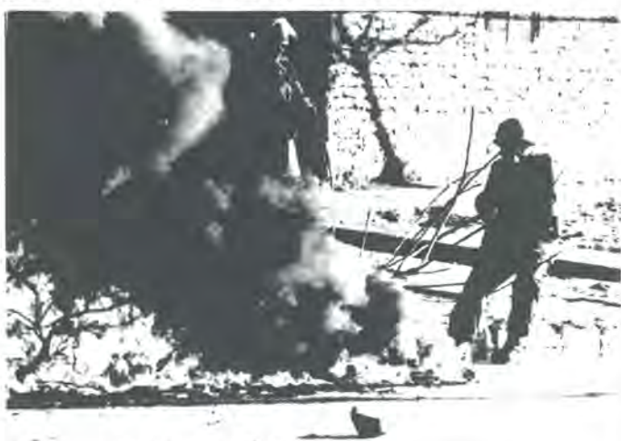
Demonstrators try to block troops approach by setting fire to tyres,

In the sphere of agriculture the military Junta followed the advice of the "Chicago Boys" to the letter. They eliminated all state intervention in the countryside following on the reprivatisation of the land. The government opened the door wide to full market forces allowing the elimination of inefficient producers supposedly to "take advantage of international competition." To facilitate this they removed all import and export restrictions on agricultural goods. This produced an ever accelerating polarisation in the countryside. At one extreme were a number of landowners who produced for the internal and international market - at the other the poor who produced for the poor. Of the latter some 300,000 families were deprived of their land and simultaneously denied the right to organise in their own defence. The state denied any technical, credit or mutual insurance facilities to these small proprietors, owners of tiny plots of land(minifundistas). This led to a situation where they had to engage in a fierce competitive struggle with one another for economic survival.