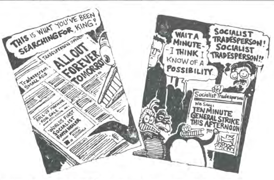
Putting-off all out action until it's too late