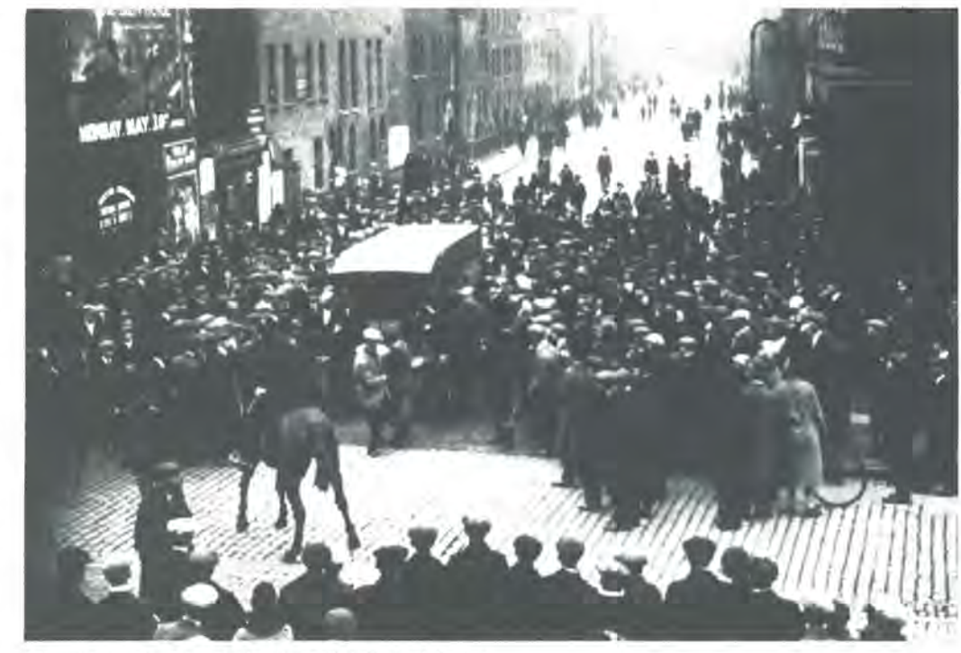
Skirmish in the East End - the 1926 General Strike

We raised our call for a general strike as a demand on the TUC leaders. We did not thereby counterpose a TUC called general strike to immediate solidarity action by groups of workers. Where we could we fought hard and long to win every possible form of solidarity support for the NGA. But we raised the call on the TUC and the trade union leaders because they remain the leadership that the organised workers look to, however sceptically. While the TUC was setting up its