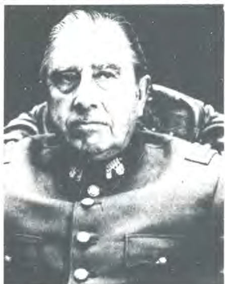
General Augusto Pinochet

In this context the Anti-Imperialist United Front tactic is applicable for the developing revolutionary party which must fight for the political and organisational independence of the proletariat. Transitory agreements struck