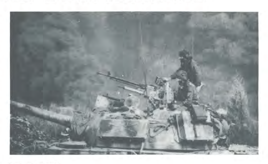
Troops loyal to Arafat

as the "political independence" of the PLO. The PLO exists in a state of political dependence upon various bourgeois and petit-bourgeois Arab regimes. The PLO compromises the objective interests of the Palestinian masses and leaves them at the mercy of the occupation forces in the West Bank. To counterpose a "new" or "independent" PLO to the old one is a utopia. The divisions and splits are a consequence of the politics of petit-bourgeois national-