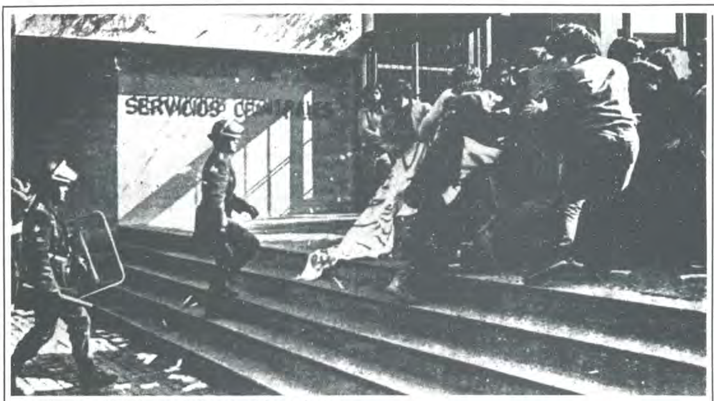
Riot police clash with students at the University of Chile in Santiago.

Firstly they characterise the June 23rd General Strike in Chile as a semi-failure. These gentlemen thus demonstrate their inability to understand the long march of the Chilean proletariat under the repression of one of the most brutal of all military dictatorships. They cannot understand these struggles as a vital and necessary part of the political and organisational recomposition of the proletariat. The strike was csrried out against the will of the traditional leaderships and of the union bureaucracy.